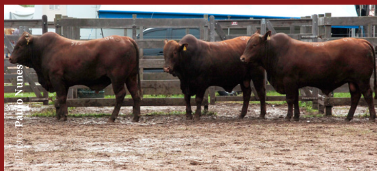
Trio of Bravon rustics from Palmeira at Expointer 2009

..... “The Devon breed itself is extremely well adapted and has excellent production characteristics. This leads us to believe that the Bravon will present even greater potential on gaining space in the national livestock breeding, given the constant increase of demand for synthetic breeds”