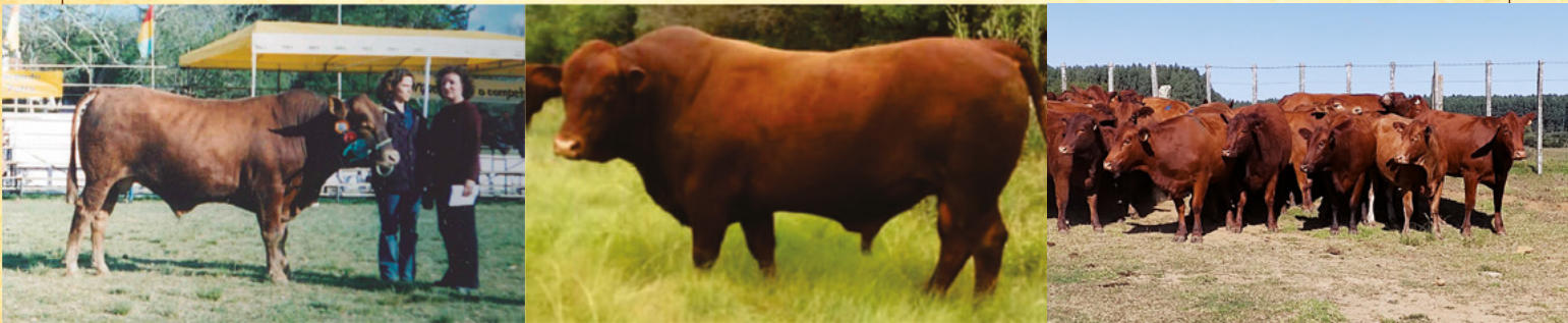
1º Grande Campeão Bravon no Brasil Timbaúba Bravon 41 Expointer 1999