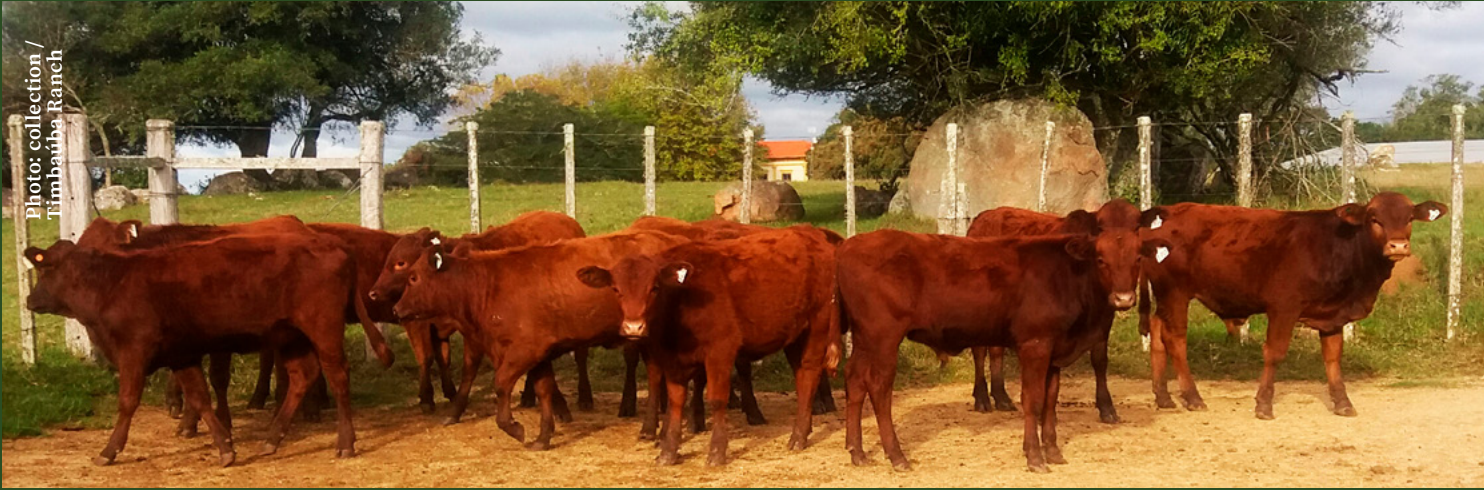
Four months old Bravon calves

The breeding is adaptable in various climates. Bravon has the advantages of adaptation to heat, rusticity, and resistance to ectoparasites of the Adaptabilitywith fertility, precocity, maternal ability and meat quality (with marbling) of the Devon.