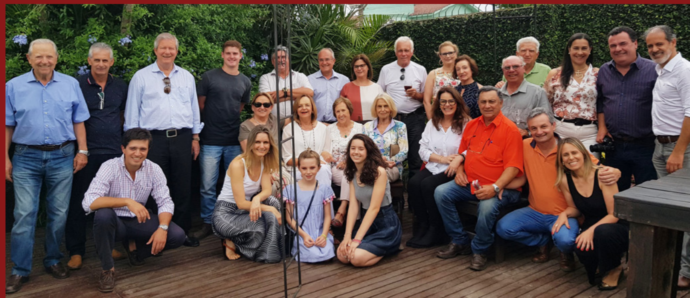
Confraternização Natal 2019