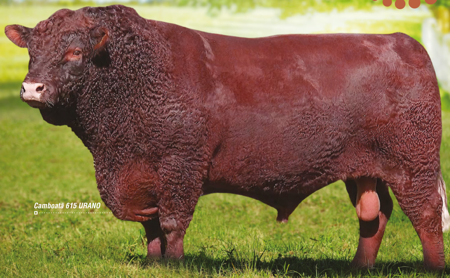
Camboatã 615 URANO