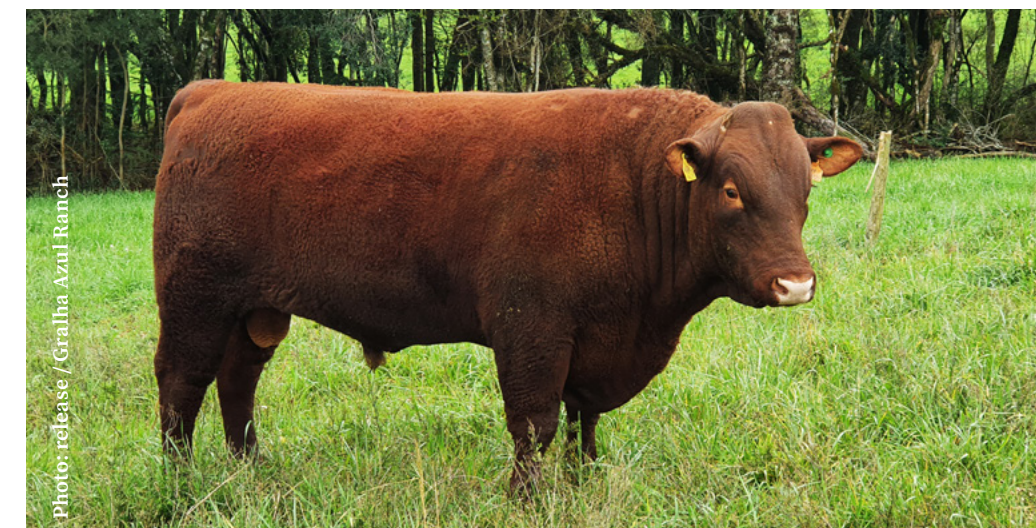
Top Devon SC: Hércules da Gralha Azul reached the greatest value

..... "The success of Top Devon is the sum of a collective effort of all involved breeders."