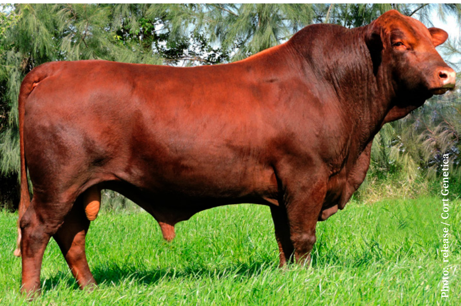
Timbaúba Bravon 135 - Tannat

T imbaúba Bravon 135 - Tannat is the first specimen of Bravon hired by a Brazilian genetic center. He is at CORT Genética, from Uruguai. Curiosity: the sire, from Timbaúba Farm, Pedras Altas (RS), has as maternal grandmother the first Bravon Grand Champion of Expointer, in 1999.