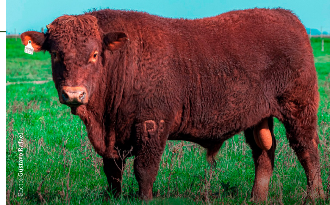
Palmeira Farm Bull won 2020 Genetic Supremacy

T he Bull Indexes launching, one of the most expected events of Expointer, also occurred in a virtual way in 2020, during the Promebo Seminar. The ABCDB opened the series of lives with the breeds, the Devon Day, in which the winners in Genetic Supremacy and National Genetic Dissemination were announced. The event promoted by the National Association of Breeders Herd-Book Collares (ANC), took place on August 1st.