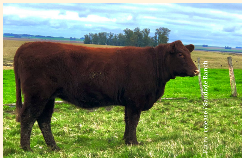
Tattoo 6041 from Saudade Ranch